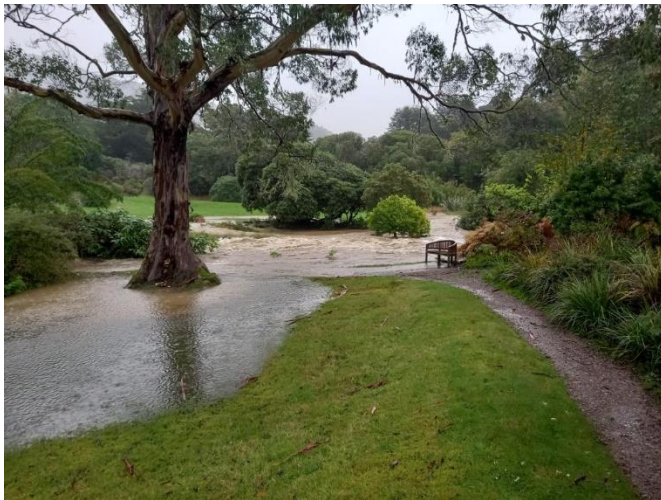
(l) Crarae burn bursting its banks, flooding lower section of the garden