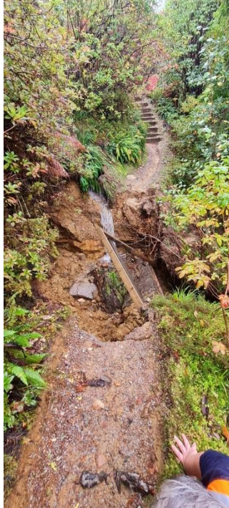
(l) washout to forest garden track (r) example of erosion on red route